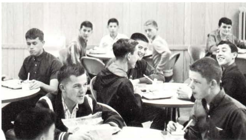
Cafeteria during lunch hour!