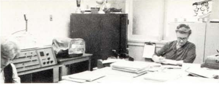
Our office heroines